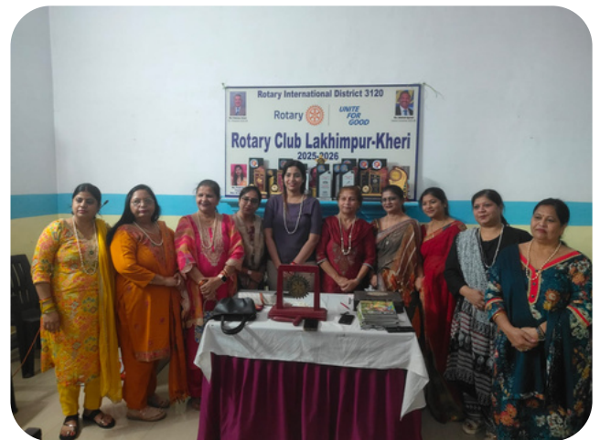
Rotary Club Lakhimpur Jyotsna