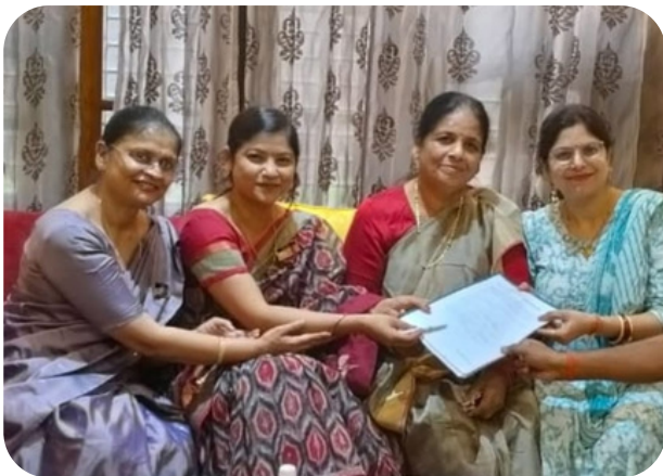
Rotary Club Gola Muskan